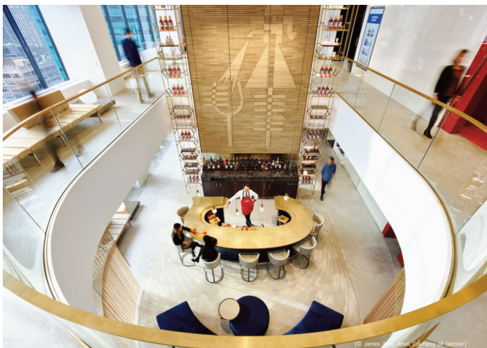
Surrounding a beautiful marble-topped espresso bar, the Smooth Duo floor displays custom gold inlays for an extra stylistic effect.

Campari Group's mission was to tie many of its areas together, including the pantry, lobby, offices, and training centers. Manufactured and installed, 12,000 sq. ft. of seamless, lustrous Smooth Duo flooring in a custom